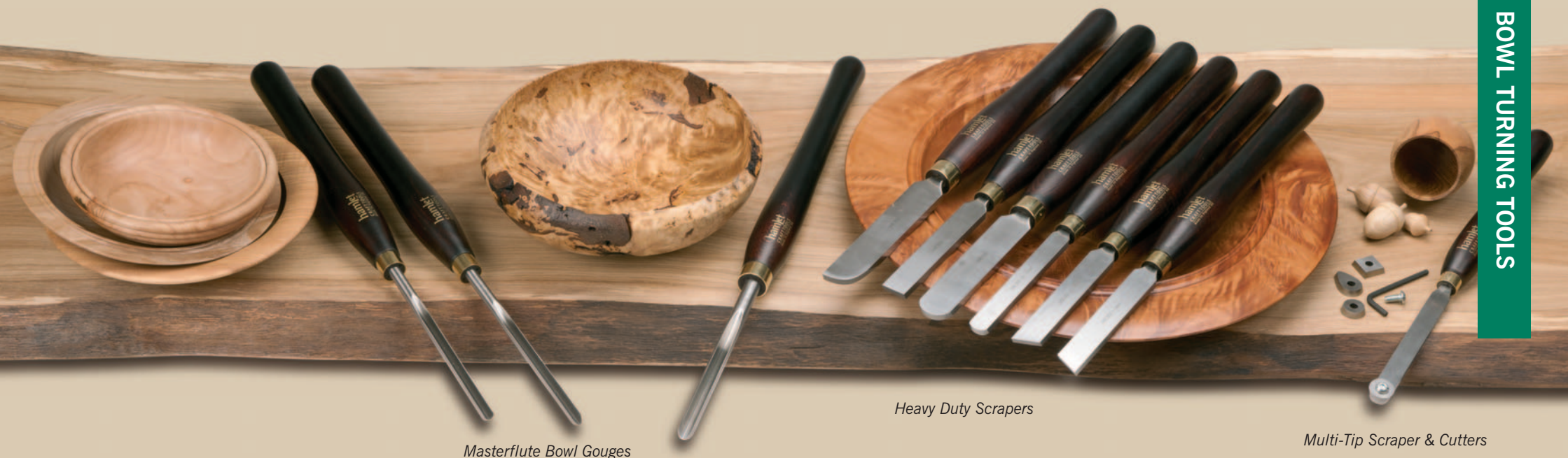
Masterflute Bowl Gouges