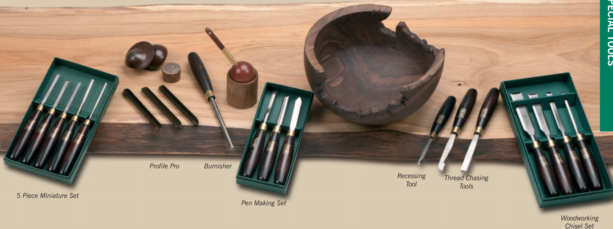
5 Piece Miniature Set