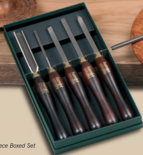
5 Piece Boxed Set