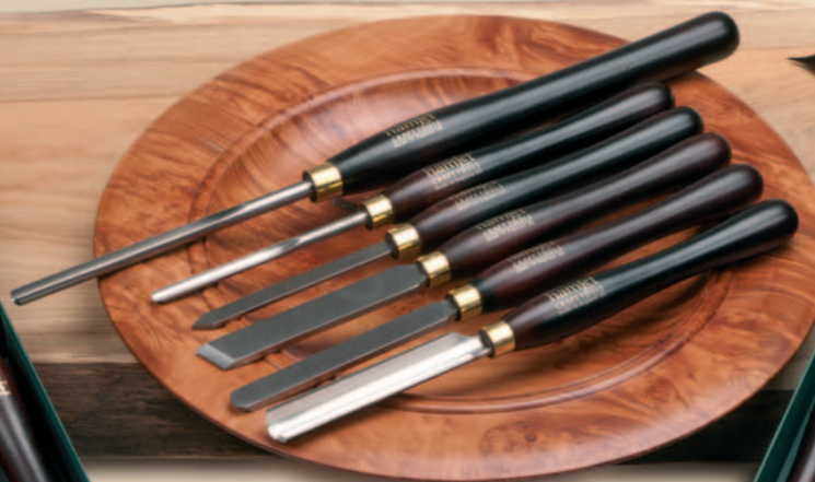
6 Piece Boxed Set