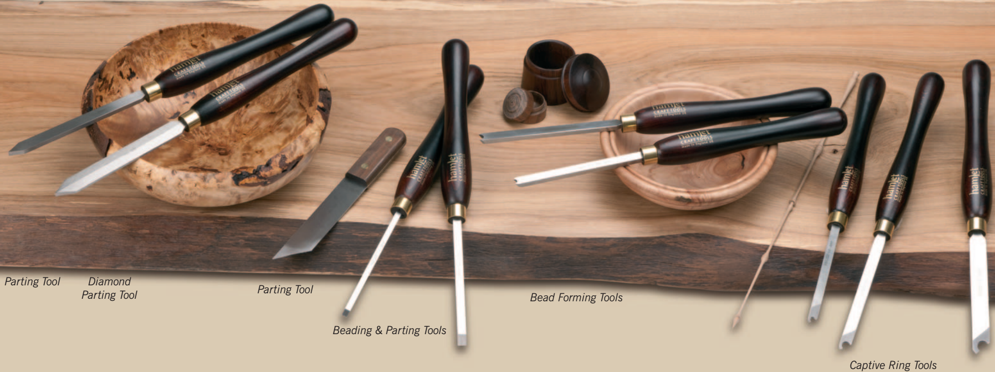
Parting Tool Diamond Parting Tool